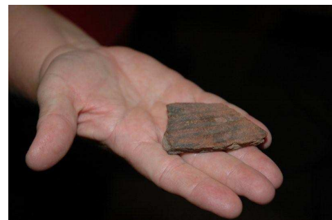
Piece of Ancient pottery found by Art