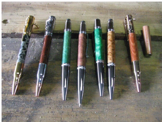
Terry at the pen turning workshop